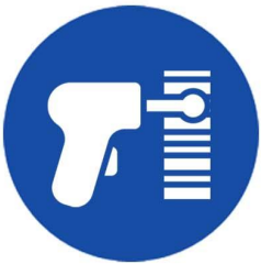
Barcode / RFID