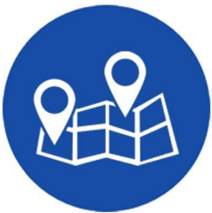
Manage Multiple Locations