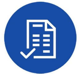
Booking / Invoice Tracking