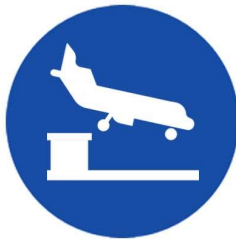
Cargo Arrival Notice